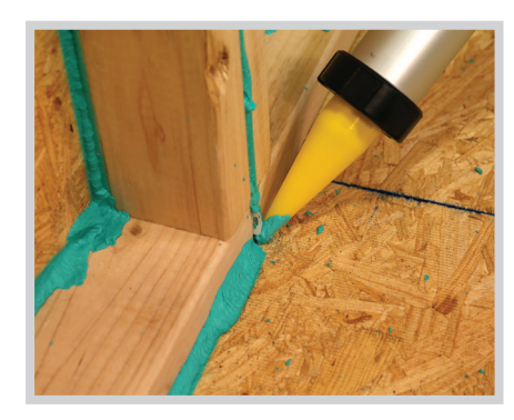
Sausage gun is an easy alternative to using an airless sprayer.