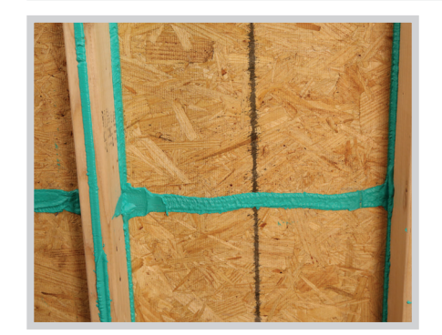
Sheathing Seam Seal