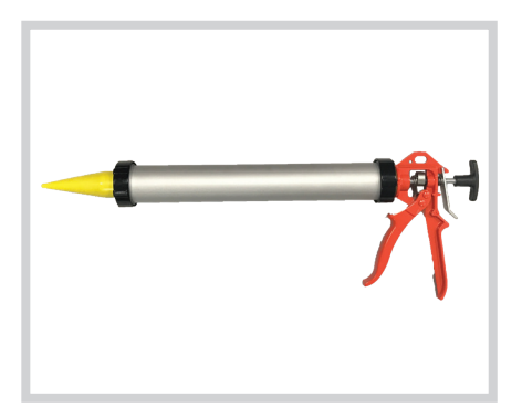
AirStop can be bulk-loaded into a sausage gun for manual application.