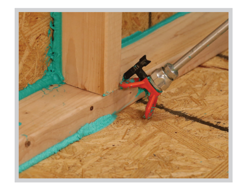
Base Plate to Subfloor Seal