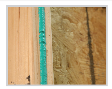
Stud Face to Drywall Gasket