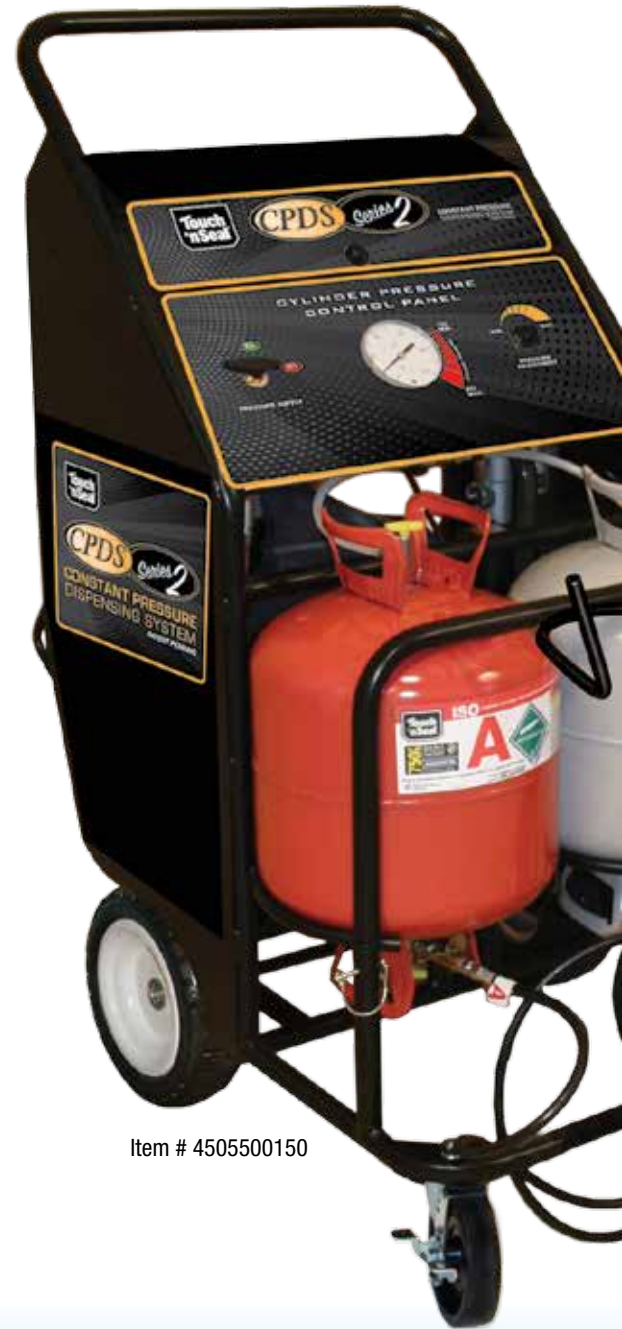
Item # 4505500150