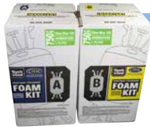
Item # 4505507520