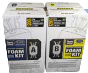
Item # 4505501200