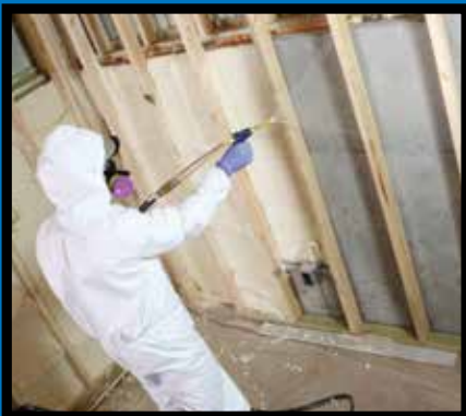
100 ft hose allows for better portability and quicker spray application.