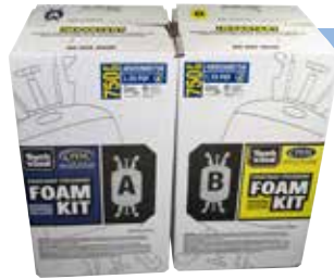
Item # 4505500750