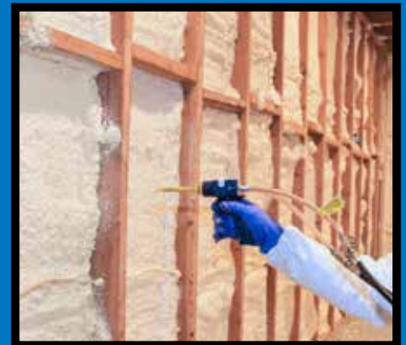
Contains 25% more material, completely empties and is applied twice as fast.