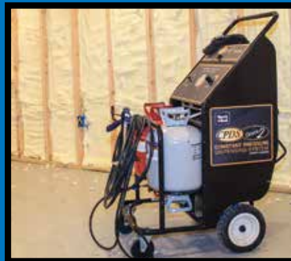
Lightweight, compact unit is easily transported.