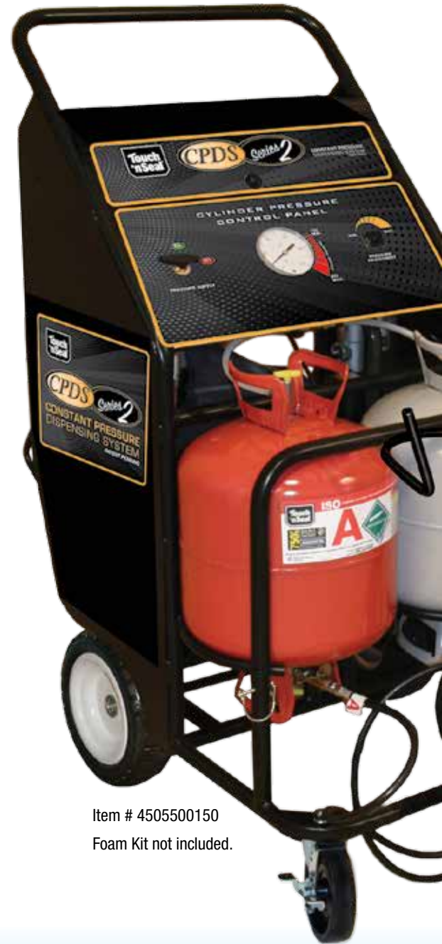
Item # 4505500150 Foam Kit not included.