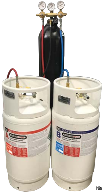
Nitrogen tank not included

Storm Bond 2 refillable cylinders deliver higher volumes of adhesive for new roofs and re-roof jobs. The two-component refillable system consists of “A” and “B” chemical tanks that are available in 17 and 60 gallons.