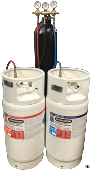
Nitrogen tank not included

Storm Bond 2 refillable cylinders deliver higher volumes of adhesive for new roofs and re-roof jobs. The two-component refillable system consists of “A” and “B” chemical tanks that are available in 17 and 60 gallons.